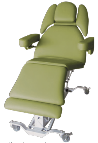
Shown with optional armrests, body/shoulder supports, and extensible footrest

The sturdy design helps to optimize your performance whilst achieving maximum comfort and support for your clients. Combine this with quiet height adjustment and you have discovered just a few reasons why this is the perfect table for your salon or spa.